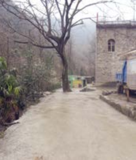
仙马教会 Xianma Church